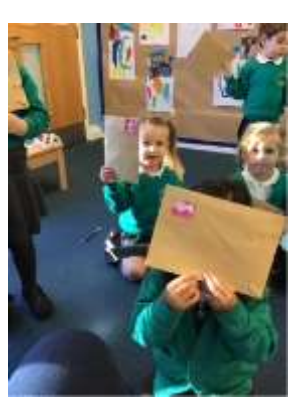
For more information visit our website: <a href="https://www.irthlingborough-inf.northants.sch.uk/home">https://www.irthlingborough-inf.northants.sch.uk/home</a> We have recently added a new calendar to support parents.