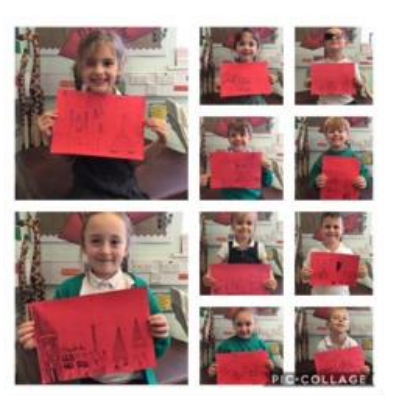
The children studied different artists to support their drawings.